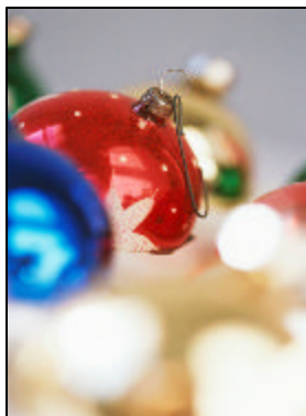
Let's beat last year's total and raise $700!