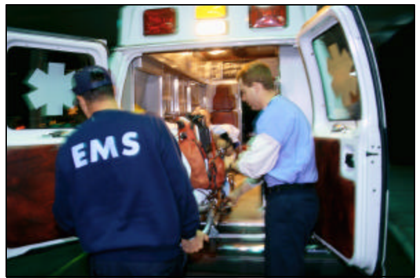
If your story involves the hard-working people behind the scenes of an emergency, this is a meeting you won't want to miss.

Have you ever wanted to give your heroes or heroines careers in the public safety fields as either a fire fighter, police officer, paramedic or search and rescue professional, but didn't know enough about the job to make it sound believable? Well, now's your chance to get that information first hand from the men and women who are (or were) out there every day protecting us and keeping us safe.